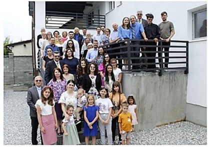
Living Hope Independent Baptist Church Hunedoara, Romania