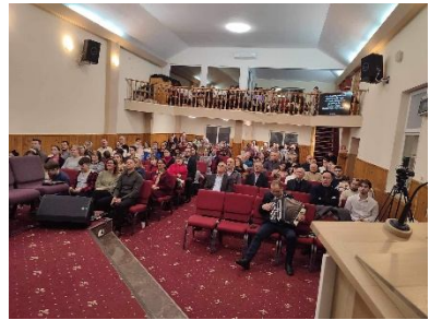
Bethel Codlea Assembly