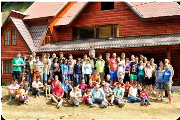
Mioveni Church Camp of 20 years in Rucar, Romania.

One purpose of this message is to show the extent to which Jewish men and women of the Bible went to give us the Bible and make salvation available to all today. Their dedication could be shown in several ways. They were brave and spoke the truth at the risk of their lives. Jeremiah was imprisoned for speaking the truth before the King of Judah. Micaiah was put in prison by Ahab because he spoke the truth from God (2 Chronicles 18:26). They manifested their love to Israel by telling them the truth whatever the cost. They were also men and women of prayer. They were faithful to God and His Word in a time when most Jews were not. They had faith. I want to use fasting as a means to show their dedication to God and man.