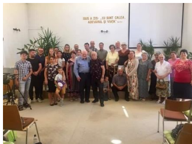
Plymouth Brethren Assembly - Mioveni, RO

A fast of seven days was called by the Mioveni, Romania church in 2020 as we started the meetings. Not all fast, but some do. A brother from a sister church attended with his family. He did not eat or drink during the seven days and nights. “In that last day, that great day of the feast, Jesus stood and cried, saying, if any man thirst, let him come unto me, and drink. He that believeth on me, as the scripture hath said, out of his belly shall flow rivers of living water. But this spake he of the Holy Spirit....” (John 7:37-39). I like to compare this living water spoken of in John 7 with “and thou shalt be like a watered garden, and like a spring of water, whose waters fail not.” This source will fail not.