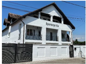
Living Hope Independent Baptist Church